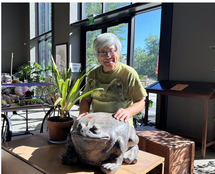
Photos from the 2023 Rummage sale