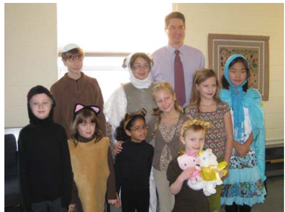
The Cast of Snow in Jerusalem